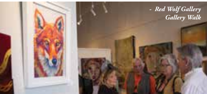
- Red Wolf Gallery Gallery Walk

Featuring one-of-a kind artifacts, uniforms, weaponry, original newspapers, and personal letters, honoring the men and women who served in our Armed Forces. 21 E. Main Street 828.884.2141 • Wncmilitaryhistorymuseum.com